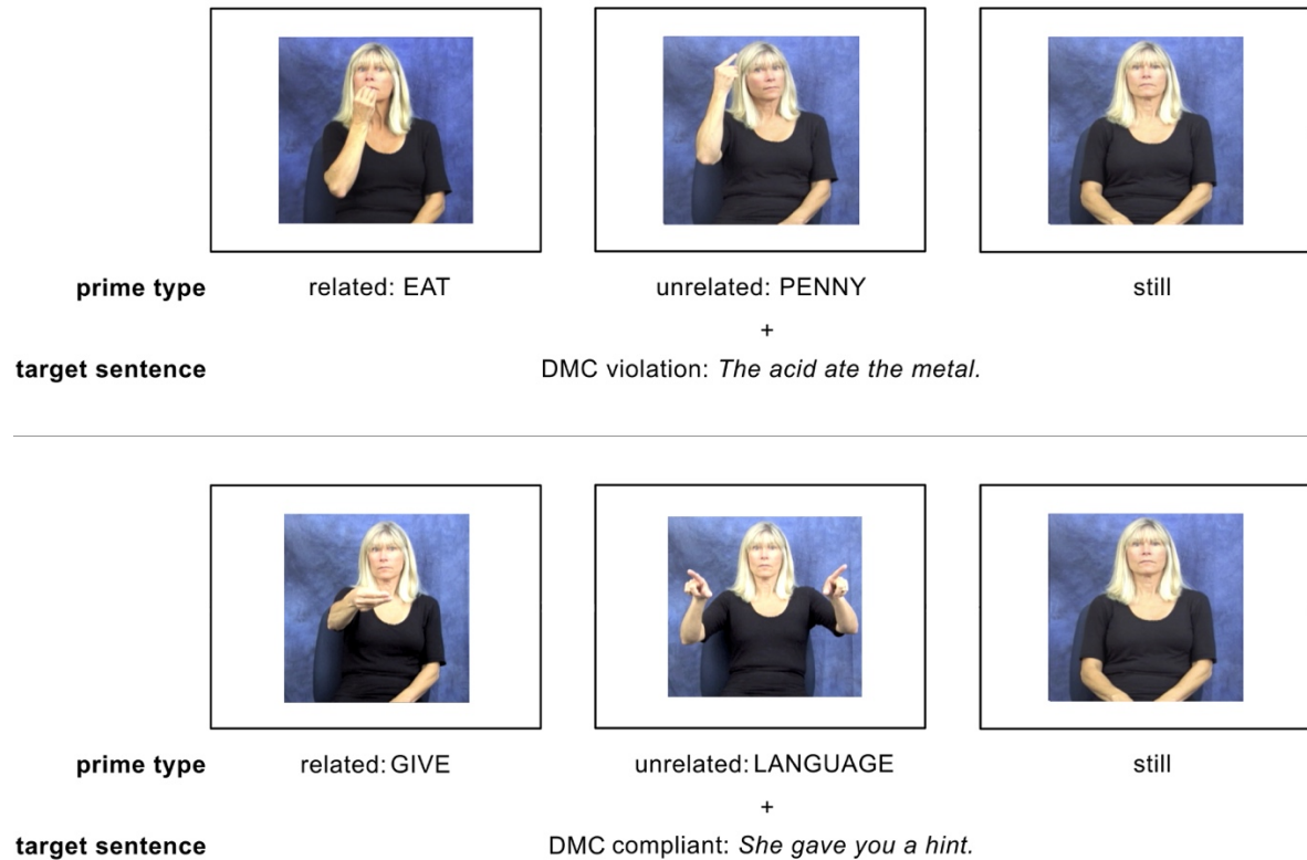
Figure 1: Examples of sign videos and target English sentences in the DMC Violation and DMC Compliant conditions.

Six comprehension questions were added throughout the experiment and presented instead of a metaphoric target to make sure that participants read the sentences. These questions were related to the content of the previous sentence target and required a simple “yes” or “no” answer. The question trials were preceded by the English phrase Question next . On average, participants answered 78.6% of these comprehension questions correctly.